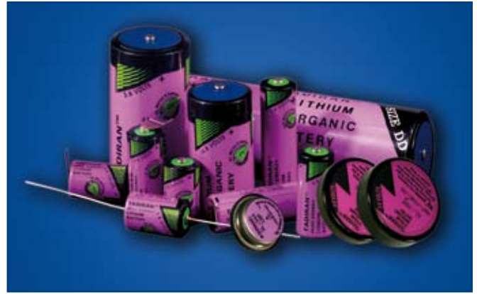
Lithium Thionyl Chloride (LTC) Batteries

e-mail: info@tadiranbatteries.de www.tadiranbatteries.de