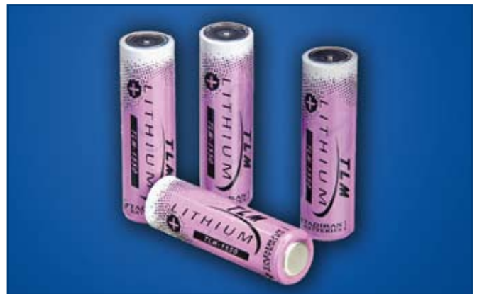
TLM High Power Batteries